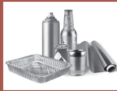
Aluminum cans, aerosol cans (empty and lids removed), foil, and trays