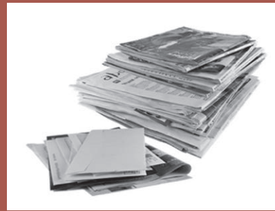
Junk mail, mixed paper, paper bags, and newspaper