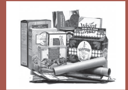
Mixed paperboard: cereal boxes coated juice containers, tubes