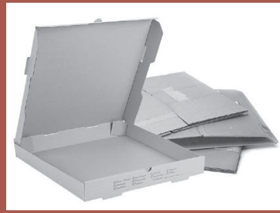
Cardboard and pizza boxes flattened

Unlike the trash can, using the curbside recycling bin takes a little thought. Madison's curbside service, like many across the U.S., uses a single stream process meaning materials are sorted at the recycling facility rather than at home. Simple right? Yes, but only if we are putting the right stuff into the bin. It is tempting to throw questionable items in to be sorted out later, but this has a negative impact on the whole system. At the very least it drives up the costs of transportation and sorting as well as requiring disposal. At worst, it can contaminate materials that would have been recyclable sending everything to the landfill instead. Save this handy guide to recycle right!