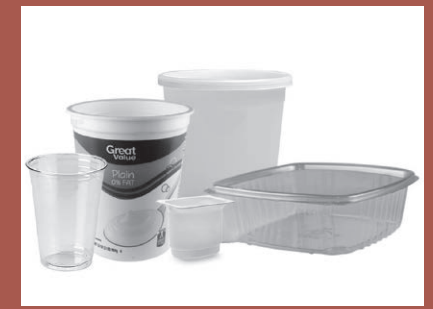
Plastic food containers and trays, except Styrofoam