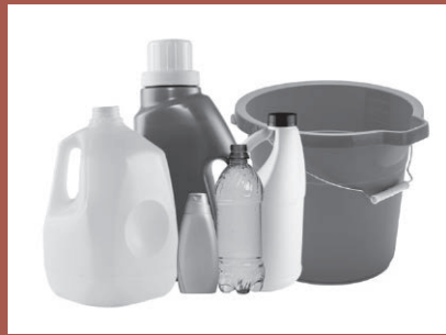
Rigid plastics, plastic bottles and jugs (except Styrofoam)