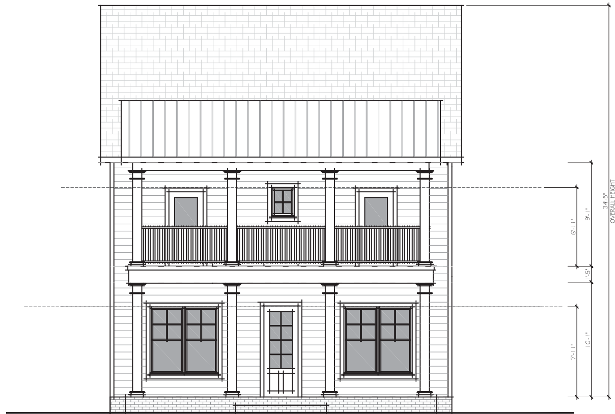
1 FRONT ELEVATION SCALE: 3/16" = 1'-0"