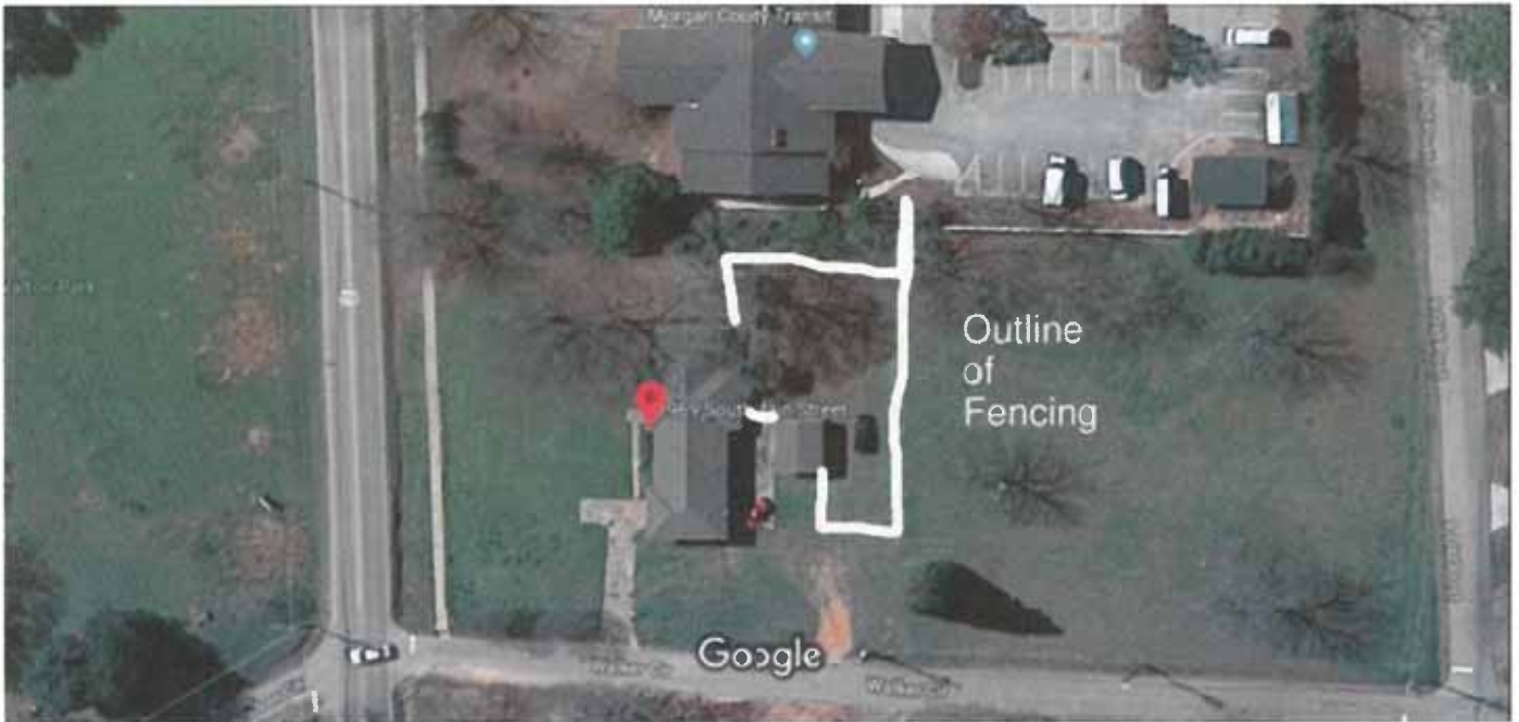
50 ft